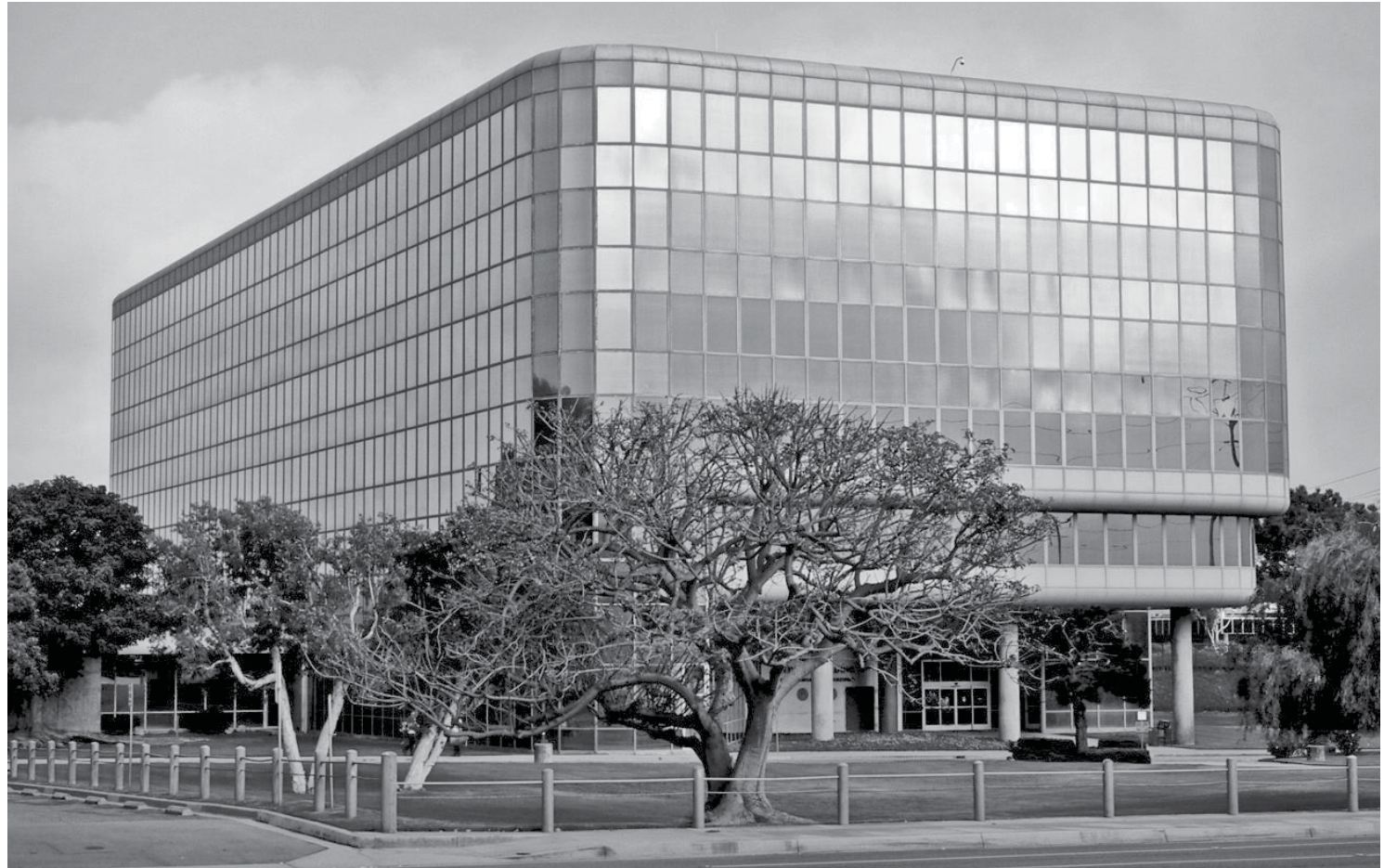
A well known and characteristic landmark in Lawndale, The Federal building at 150000 Aviation Blvd., houses the Federal Aviation Administration's West Coast Headquarters. The building was the first-designed Southern California building to have a mirrored skin. The mirrored glass skin became ubiquitous on corporate architectural designs of the 1970s and 1980s.