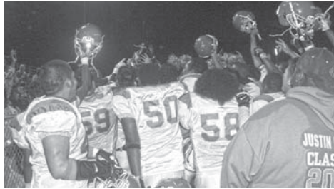
Hawthorne football players celebrate with Mayor's Trophy in background after their 44-8 victory over cross-town rival Leuzinger last Friday.